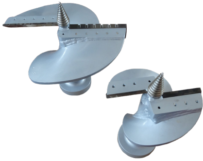
STUMP PLANER Available with 300mm or 500mm blades (ridged type for hardwood)