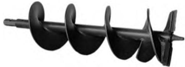
AUGER with plain earth blades: 100mm to 500mm standard diameters*

*Other diameters are available on request