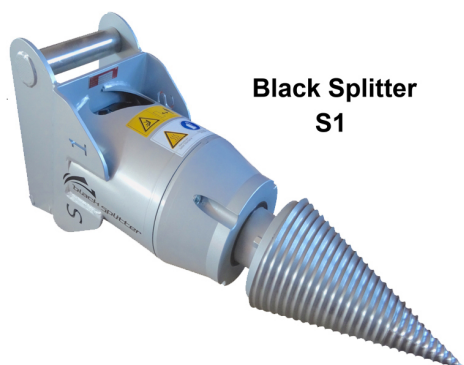
Black Splitter S1