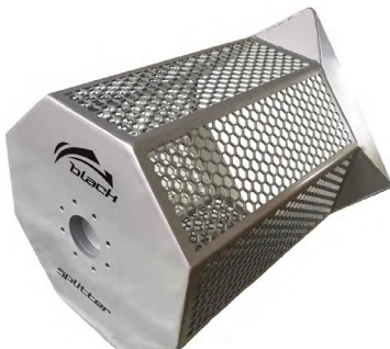
SCREENING BASKET 40mm grid, produces 30mm downwards material. Four flat edges for easy loading and flat sides create efficient tumbling / screening action