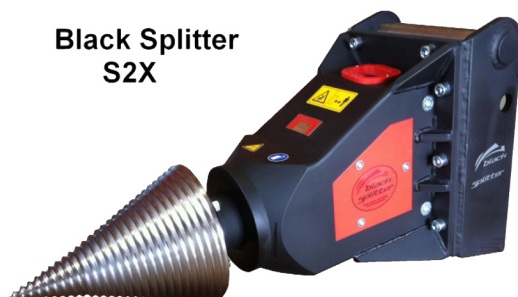
Black Splitter S2X