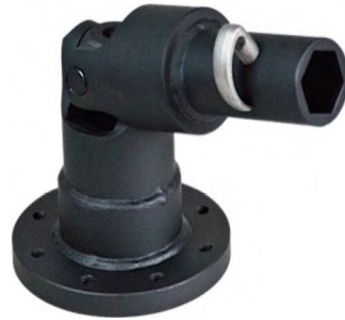
AUGER ADAPTER with universal joint.