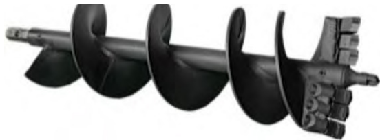
AUGER with tungsten carbide teeth: 100mm to 500mm standard diameters*