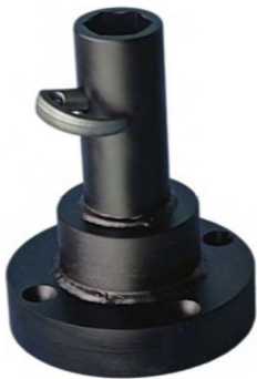
AUGER ADAPTER Without universal joint

*Other diameters are available on request