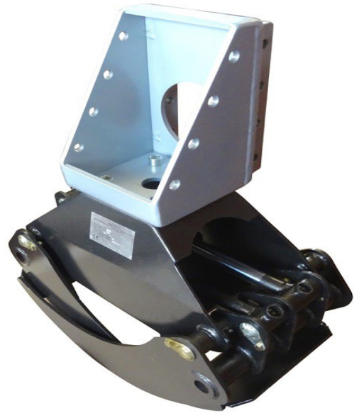
Timber Grab Adapter for S2 Timber Grab (opening width 1030 mm) Diverter valve kit available for operation of Grab & Splitter functions from 1x double acting circuit