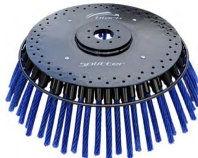
STEEL BROOM 750m diameter with 64 coated steel brushes; 450mm diameter with 32 coated steel brushes