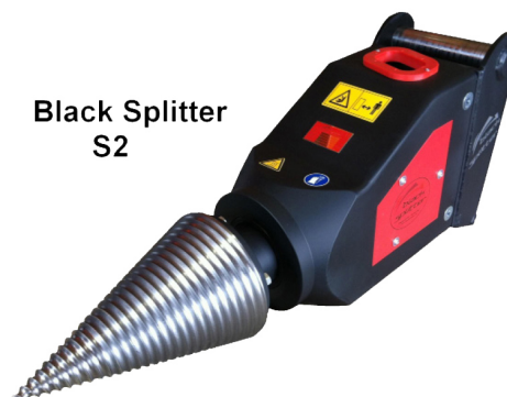
Black Splitter S2