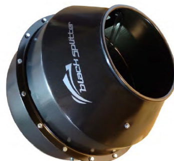
MIXER BUCKET Available with 130L, 145L, 165L capacity